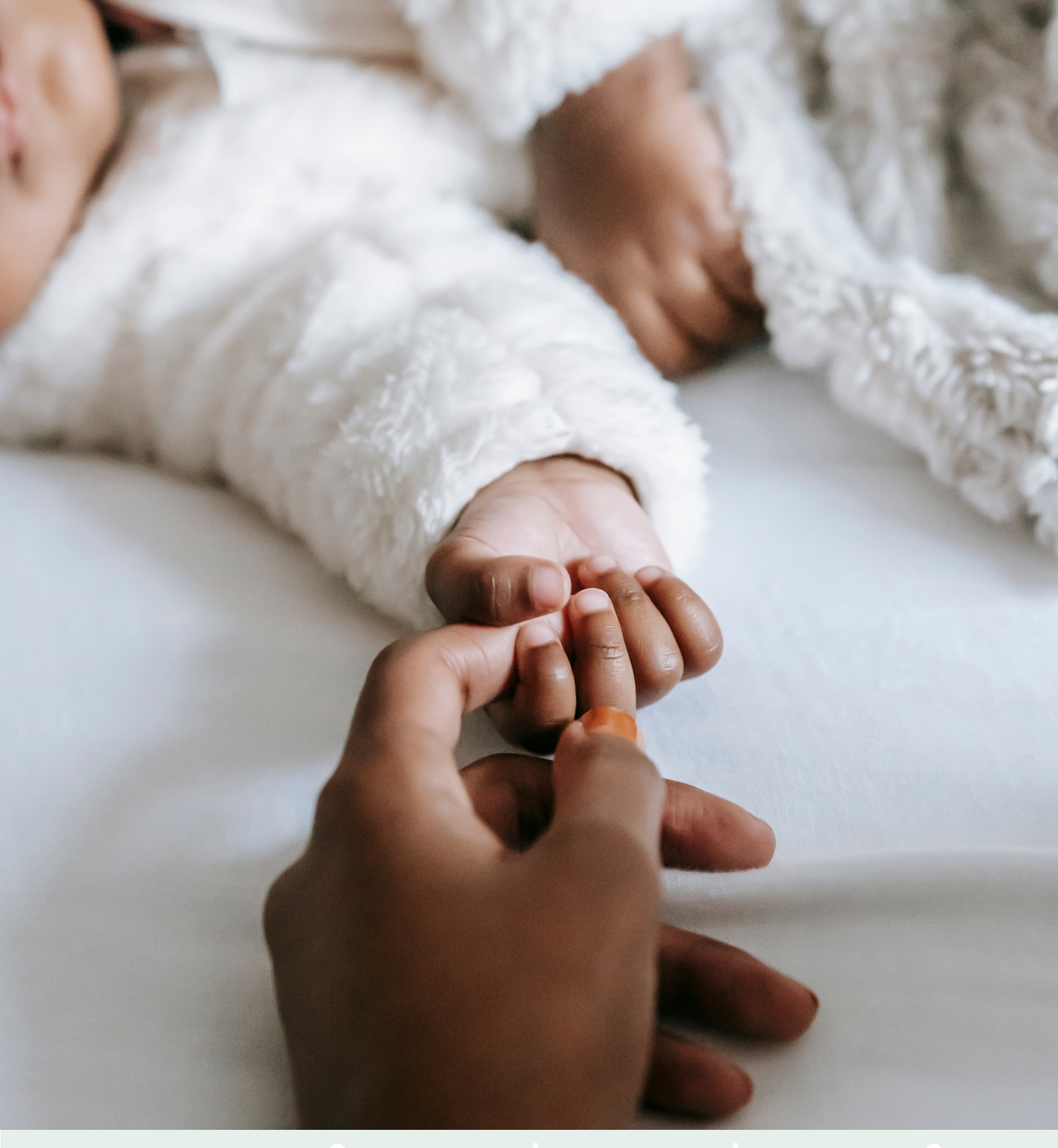
www.abionacentre.ca | Our Mission | About Us | Donate You can also find us on social media!